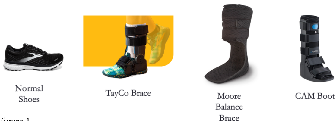
Figure 1 Bracing conditions utilized during study. Braces were randomized for each participant